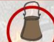
leather water bucket